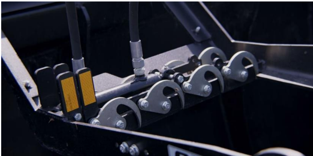
Bale wrap handler, available accessory for Silocut L+ and XL+

Find out more about Ålö at www.alo.se and about our products at www.quicke.nu