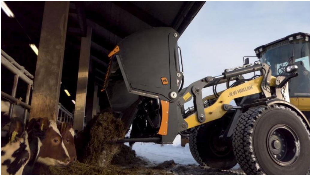
Push out mechanism in action on a Silocut L+ tine version.