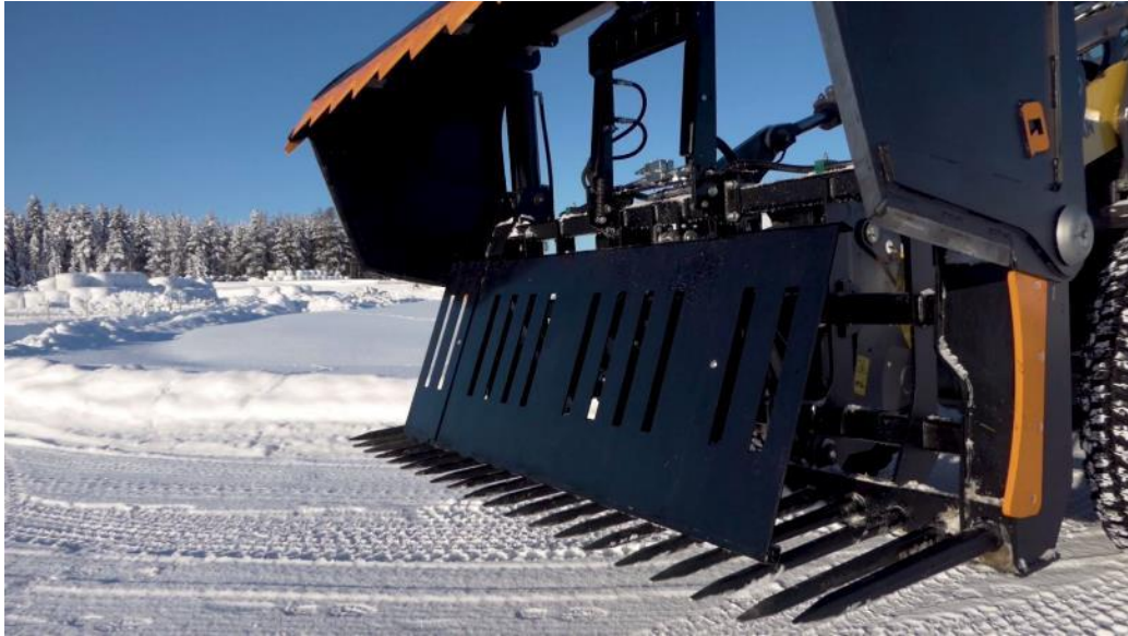
Push out mechanism on a Silocut L+ tine version