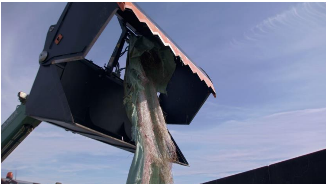
Bale wrap handler on a Silocut bucket version